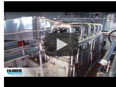
Sewage Sludge Drying with HUBER Belt Dryer BT https://www.youtube.com/watch?v=6VTJ1ex10bQ