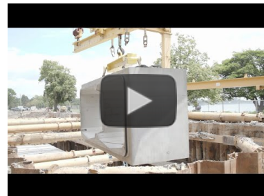
Three Projects, One Goal: Highlighting Stormwater Management in New England

https://www.youtube.com/watch?v=MGrAG0bs4xQ