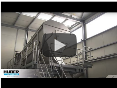
Video: HUBER Grit Treatment System RoSF 5 in disposal industry

https://www.youtube.com/watch?v=a2f19eGOEsk