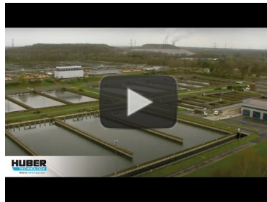
Video: HUBER Grit Treatment System RoSF 5 at major WWTP "Emschermündung"

https://www.youtube.com/watch?v=ZVP2aWdm9AE