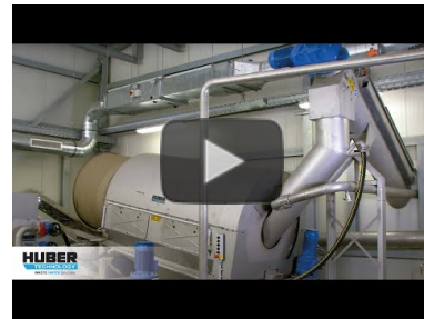
Video: HUBER Grit Treatment System RoSF 5 - grit recycling at WWTP Schwarzenberg

https://www.youtube.com/watch?v=SpqkL361Sc