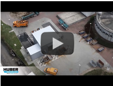
Video: HUBER Grit Treatment System RoSF5 at WWTP Frankfurt-Niederrad

https://www.youtube.com/watch?v=ZVP2aWdm9AE