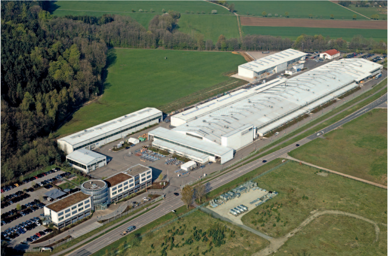
HUBER headquarters and production at Berching, Bavaria