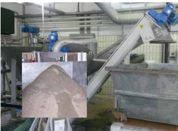
Grit washer installation on a municipal sewage treatment plant.