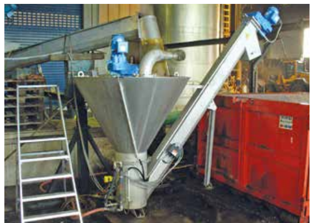
Special design for the treatment of sediments from biogas plants.