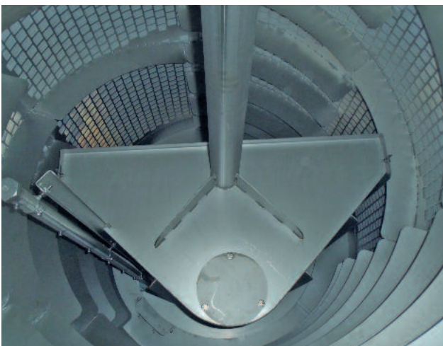
HUBER Drum Screen RoMesh® for optimal separation of very fine particles