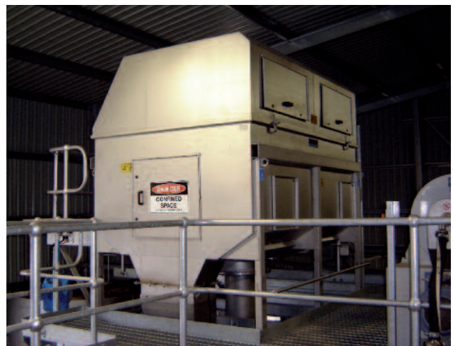
Installation of a HUBER Drum Screen RoMesh® for industrial wastewater treatment