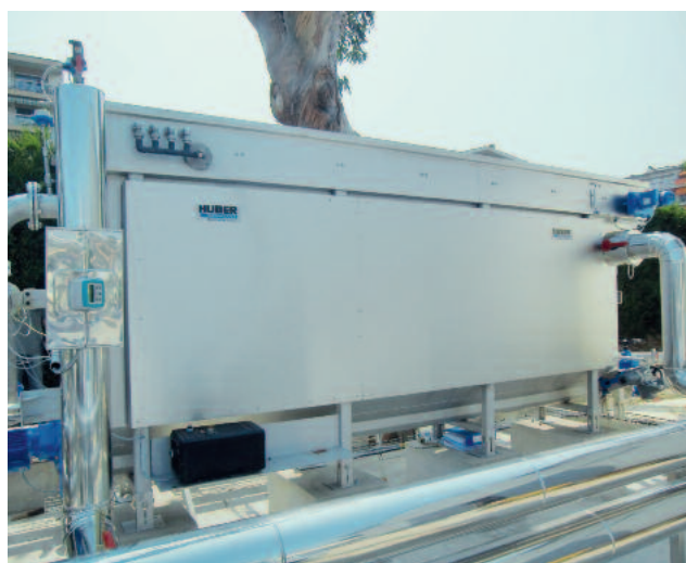
HUBER Heat Exchanger RoWin installed on the Côte d'Azur