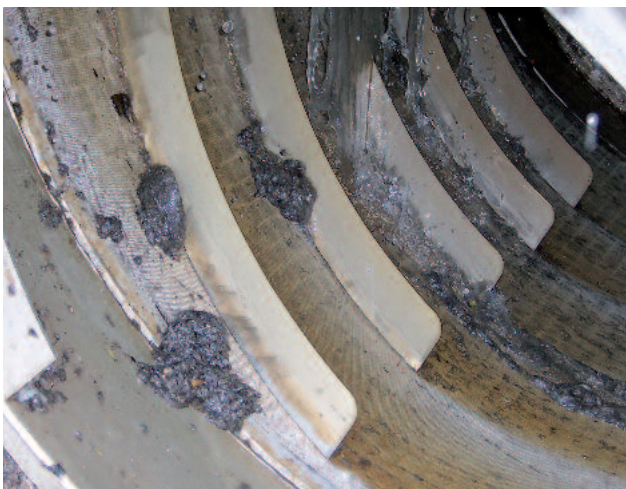
Optimal separation of fibres