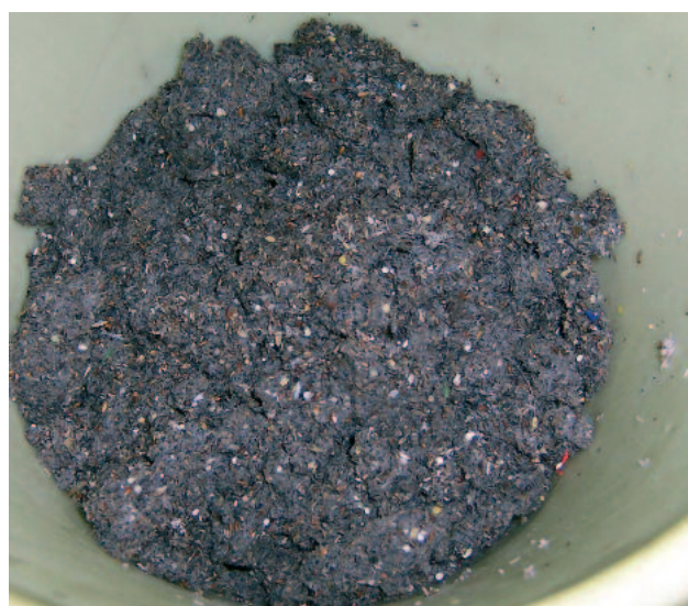
The ROTAMAT® Pipestrainer removes very fine screenings (such as hairs) after a preceding coarse screen