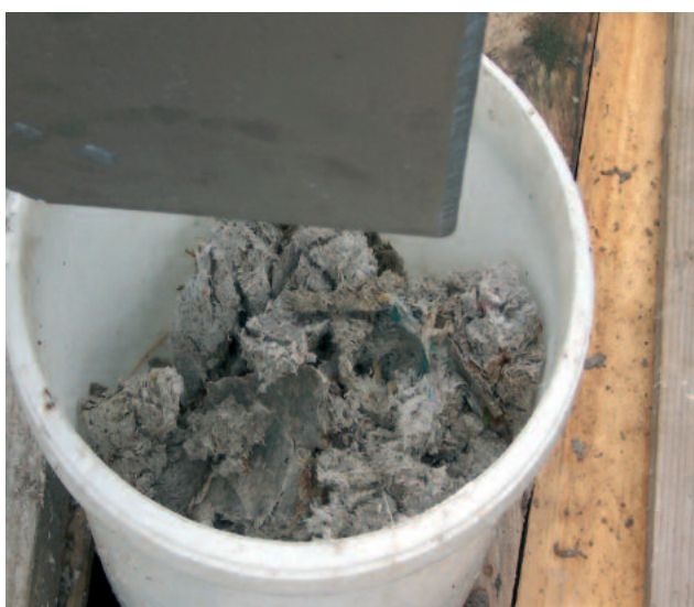
Screening of municipal wastewater with a high content of fibres (in particular toilet paper)