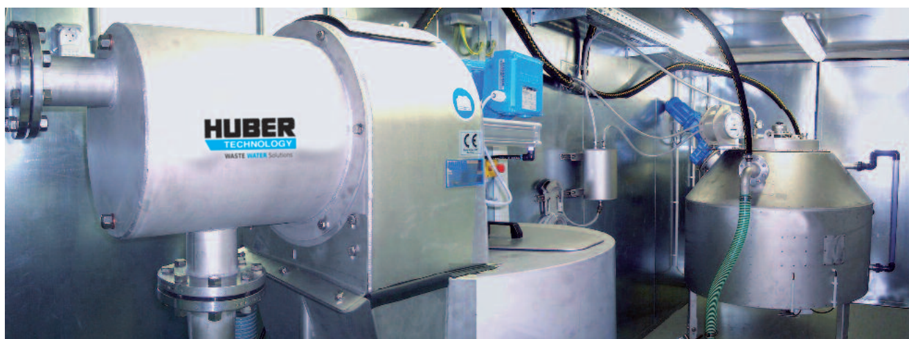
ROTAMAT® Pipestrainer used for brown water screening for later humus recovery